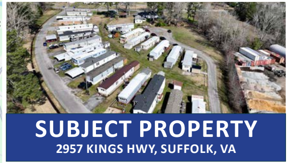
SUBJECT PROPERTY 2957 KINGS HWY, SUFFOLK, VA